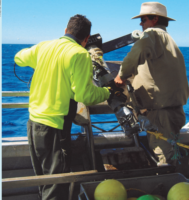
Deployment of IMOS acoustic listening station in the Perth Canyon by CMST staff