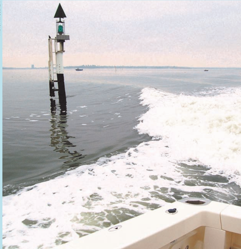
Boat wake produced by a 15m power boat travelling at 9.8 knots. Waves measured by a submerged wave recorder attached to pylon.