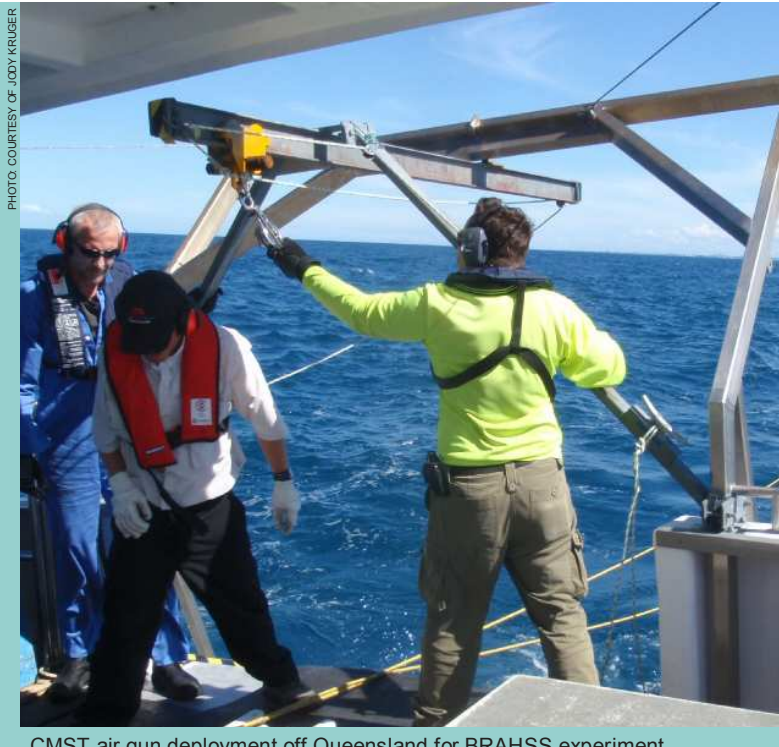
CMST air gun deployment off Queensland for BRAHSS experiment

of Sydney and volunteer groups. The second experiment will take place in September and October. The project is funded by the International Association of Oil and Gas Producers E&P Sound and Marine Life Program. Further information can be obtained at the following web address: www.soundandmarinelife.org.