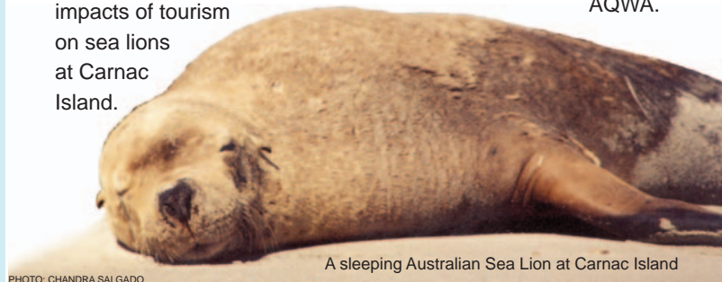
A sleeping Australian Sea Lion at Carnac Island

These projects are aimed at building a growing knowledge of this vulnerable species and are being conducted in cooperation with various groups including Richard Campbell from DoF/DEC, and AQWA.