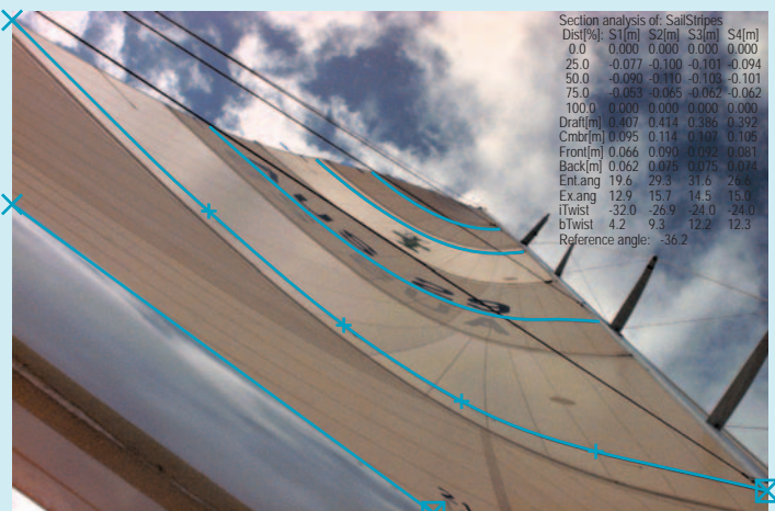
SailTool analysis of sail shape on an America's Cup Yacht

Further details about the freeware version of SailTool are available from the CMST website: www.cmst.curtin.edu.au/sailtool