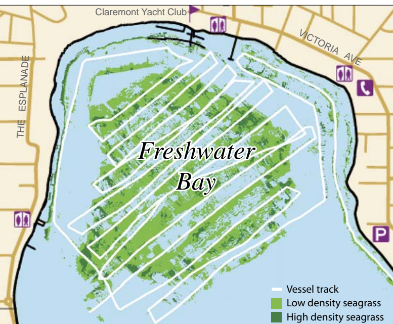
Vessel track and initial habitat classification from one of the Swan River acoustic surveys.

other measures of seagrass condition are routinely used as broad scale biological indicators of marine and estuarine health. To date the distribution of seagrass in the Swan-Canning Estuary has been assessed using aerial photographs but with little or no ground-truthing to verify the images. Aerial images are prone to several errors and ground-truthing by divers is labour intensive and also prone to error. Sidescan sonar provides a viable alternative to aerial surveys and divers.