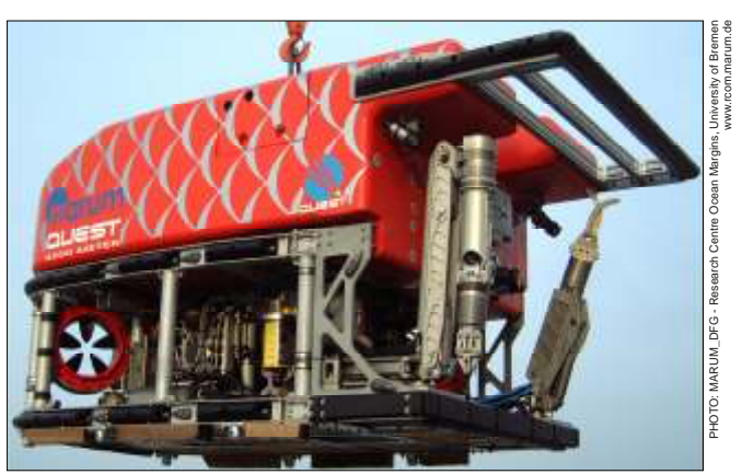
An example ROV being considered for the National Research ROV.

Because some 80% of the AEEZ (Australian Exclusive Economic Zone) is deeper than 200m, a deep-water capable system is recommended, and alternative deployment options are outlined to ensure that the system can also be used for operations in shallower waters, and from smaller operating vessels. A stakeholder survey and discussion document are available at: http://www.cmst.curtin.edu.au/ research/nationalrov