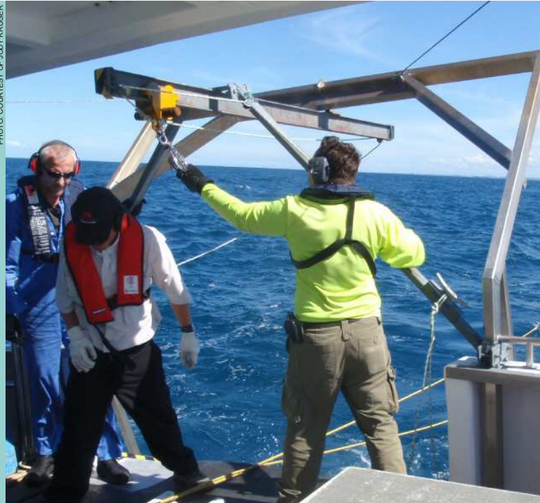
CMST air gun deployment off Queensland for BRAHSS experiment